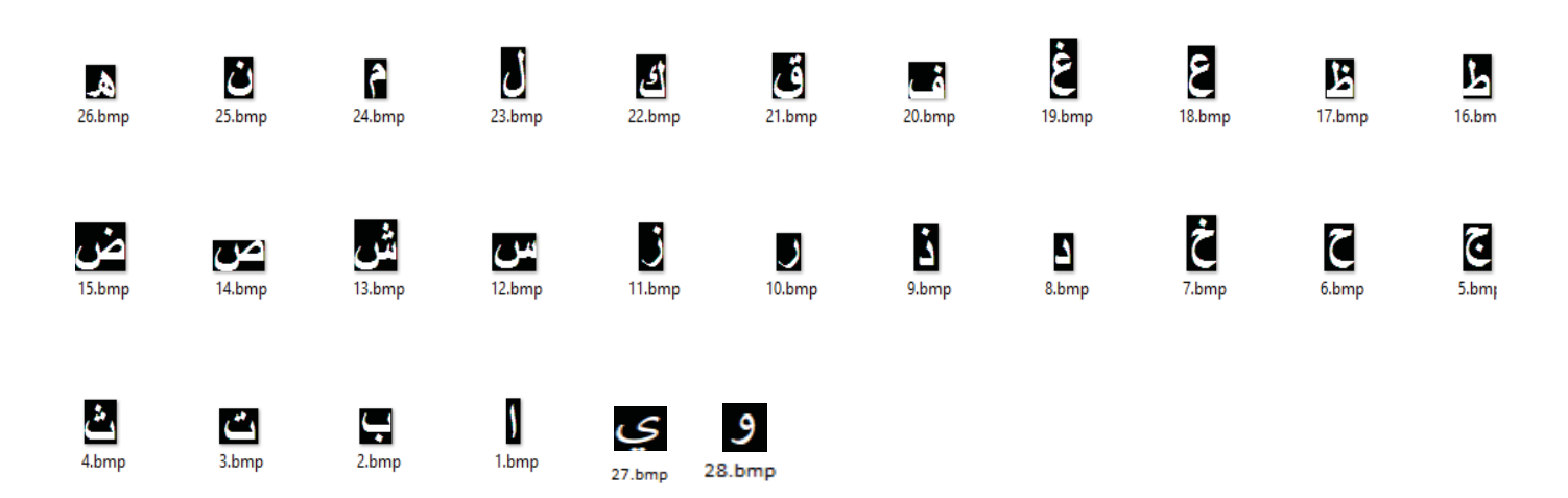
fig.3: template of the character using a database for recognition